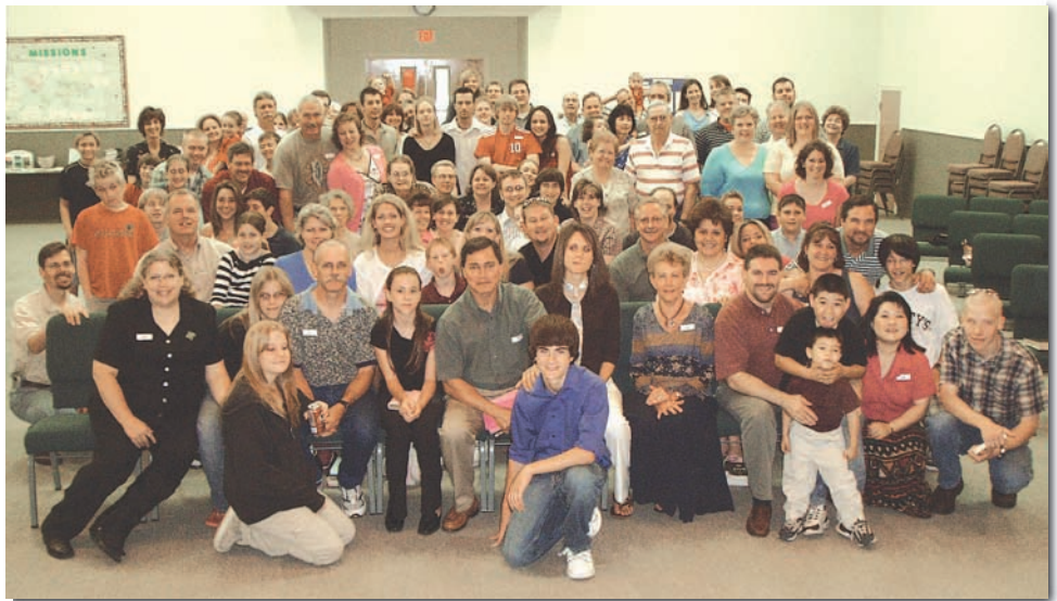
Burlson Bible Church folks

The problem with fruit inspection. See GraceNotes 28 inside!