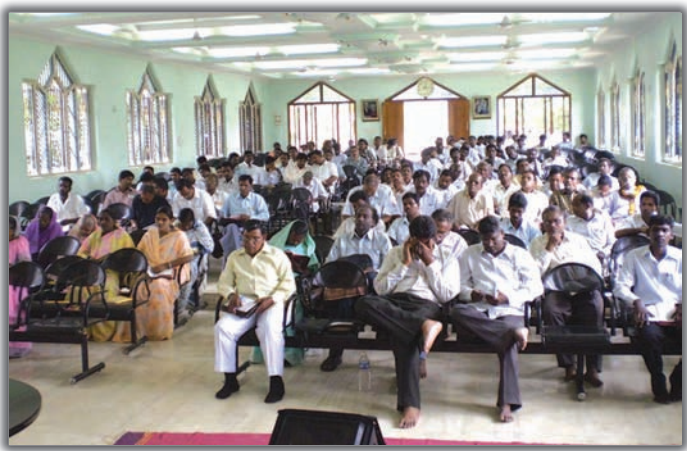
Indian pastors in Kakinada

My previous trips to India have shown me that pastors and evangelists are in tremendous need of training—and that is an understatement! With our grace teaching, we meet a great need, equip them for ministry, and “fire the first shot” that wins the battle for the gospel of grace.