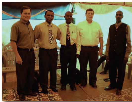
Pastors from Congo, Rwanda, Kenya

I knew that there is grace, but now I have that experience. . . I don't have enough words to express how good I feel in my heart. May God bless you so much and those who helped you at home in the U.S.A.