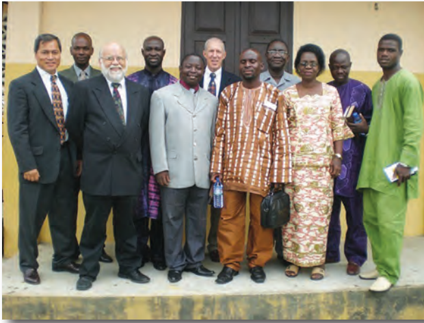
Ghana team with pastors from Mali