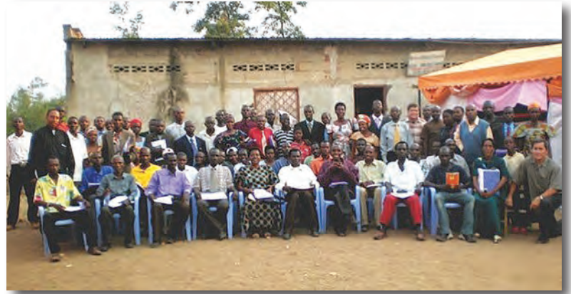
The Burundi pastors.

"I have been transformed through your teaching."