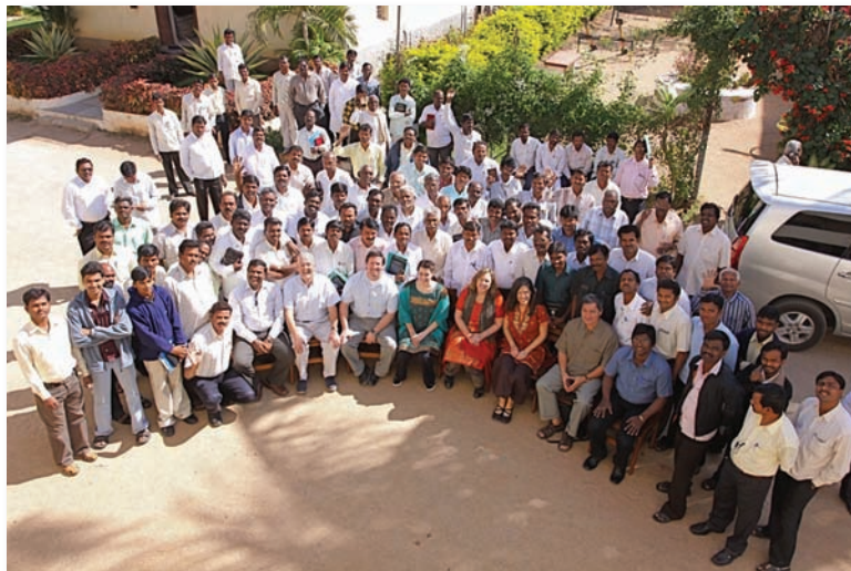
Pastors selected for first conference

Grace brings me into the deepest levels of the Word of God. . . I praise God for you that He would bring you thousands of miles to come here and bring us the truth. God chose you and sent you to make us disciples. Thank you very much.