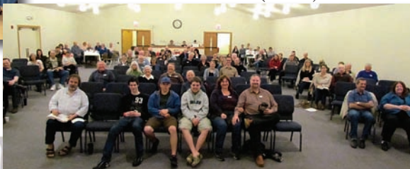
North Umpqua Bible Fellowship, Glide, OR, Mar. 25 (below)