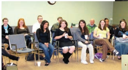
Shasta Bible College students, Redding, CA, Mar. 19-20 (below)