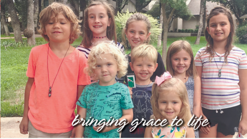
bringing grace to life.