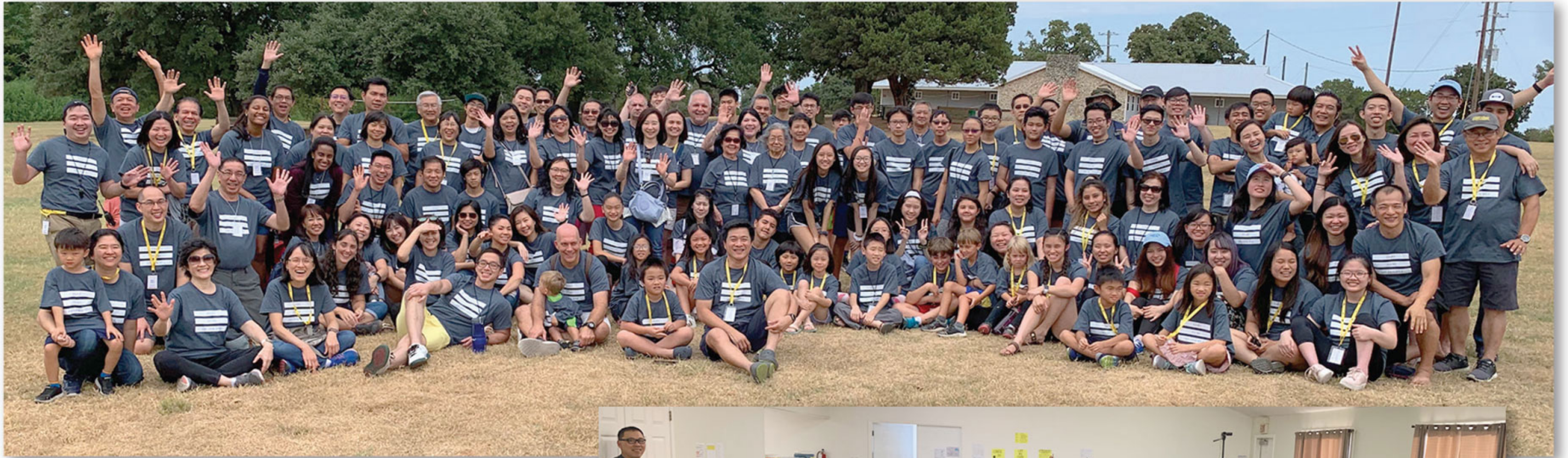
In August, Burleson Bible Church, TX; Packsaddle Fellowship, Kingsland, TX; Living Stones Fellowship Retreat, Dallas