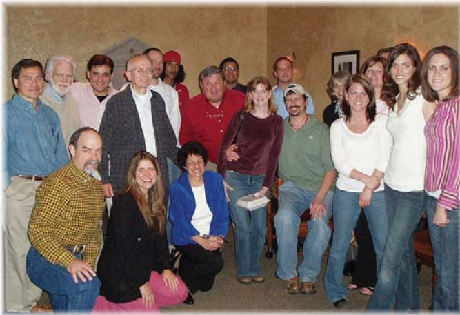
March: GraceLife friends at the Grace Conference in Dallas.