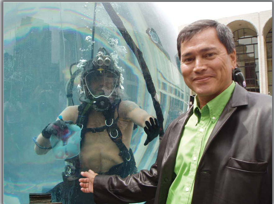
New York City, May 8

That same evening Blaine was pulled out of the tank in front of a media circus that put him on display to the whole world. What did the half-drowned stunt magician have to say to the world? "Thank you . . . I love you . . . I've failed."