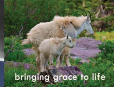
bringing grace to life