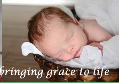
bringing grace to life